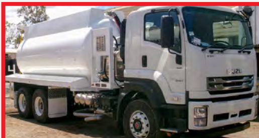
6X4 12.5KL VAC TRUCK 12,500 LITRE VESSEL