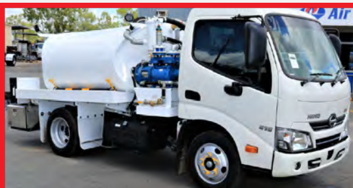
4X2 3KL VAC TRUCK 3,000-8,000 LITRE VESSEL